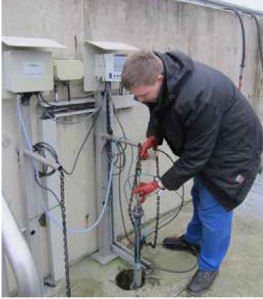
Employees of the wastewater treatment plant during the removal of the spectral sensor