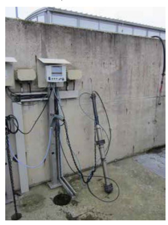
Installation of the CarboVis® in the inlet

Do you have further questions? Please contact our Customer Care Center: